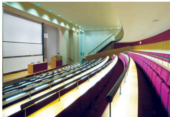
Edmund J. Safra Lecture Theatre